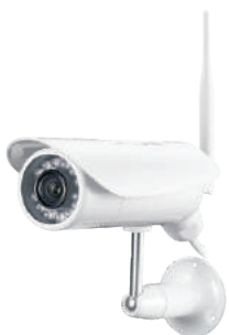
3G Network Camera